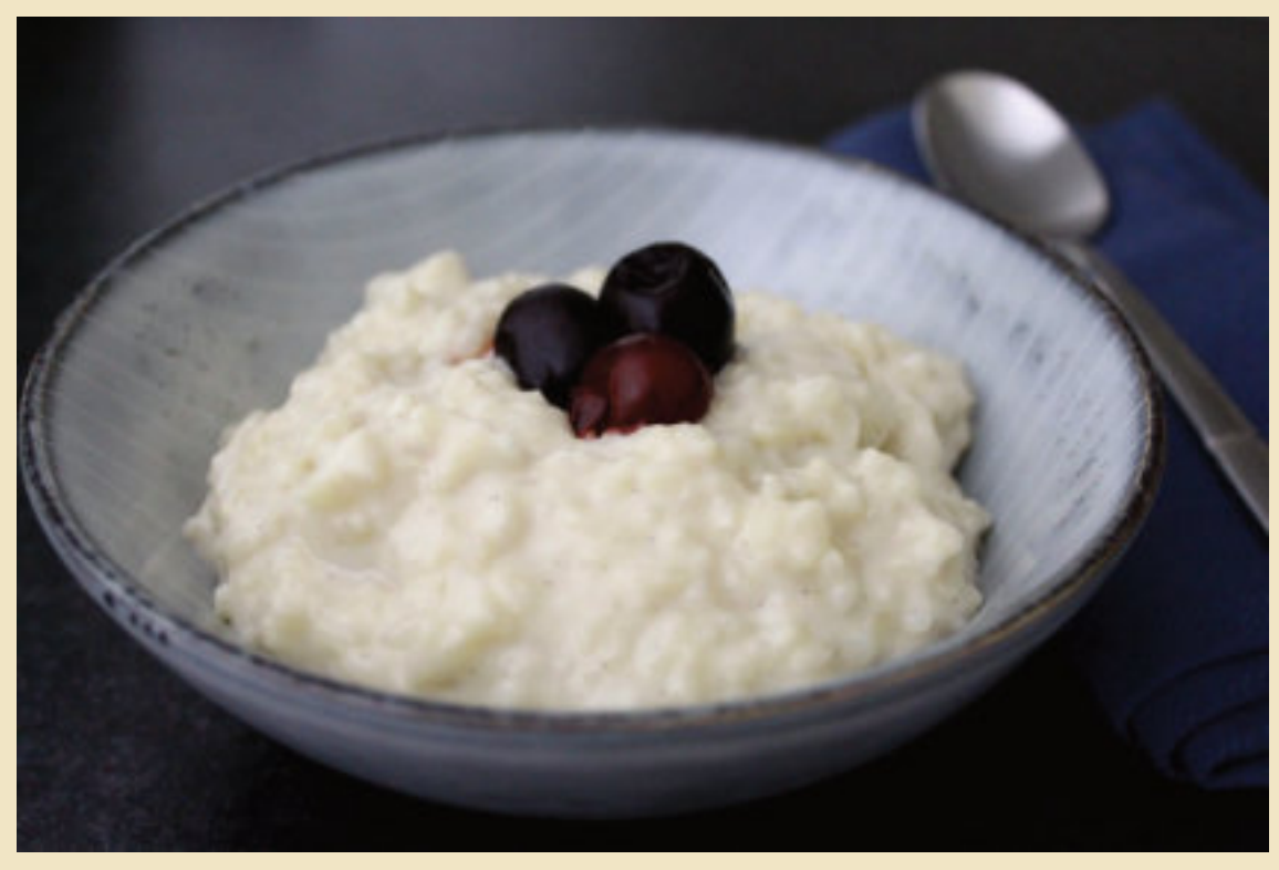
Photo of Almond Milk Rice Pudding

Place rice in pot of water and bring to a boil. Drain water and add almond milk until rice is cover. Stir constantly, add almond milk a half cup at a time until all milk is absorbed. If rice is not fully cooked after all almond milk is used, use additional water (or almond milk). When rice is fully cooked add sugar, mixing in thoroughly. Place in serving bowl and sprinkle with more sugar.