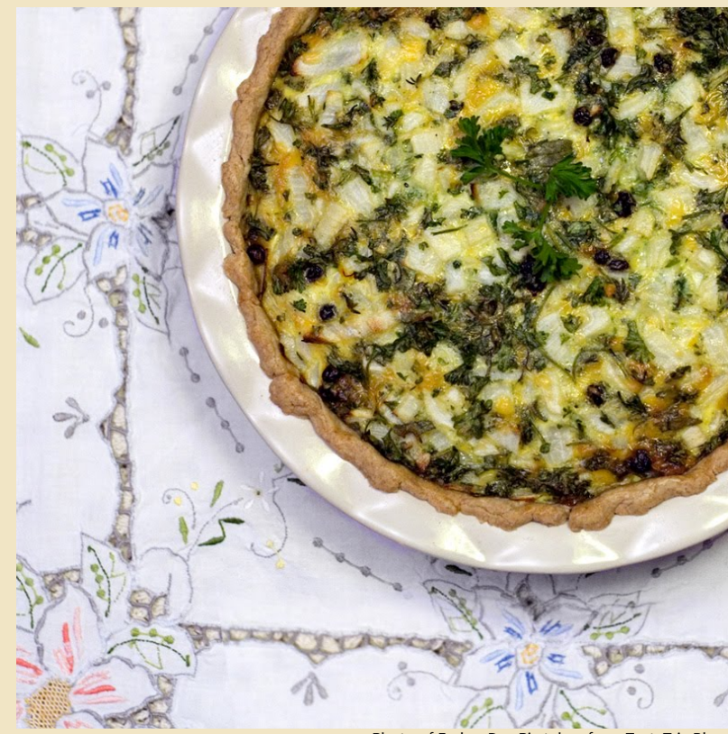
Photo of Ember Day Pie taken from TastyTrix Blog; Day 9: A Tart for Ember Day, a Luscious Cheese, Onion & Parsely Pie, 2009

"Powder douce" was a mild mixture of spices, often containing sugar with cinnamon & related spices, but without pepper.