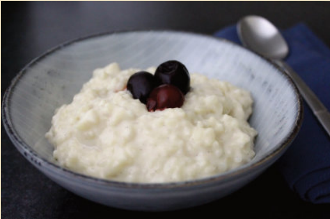
Photo of Almond Milk Rice Pudding taken from The Lifestyle Circle with Claire

Place rice in pot of water and bring to a boil. Drain water and add almond milk until rice is cover. Stir constantly, add almond milk a half cup at a time until all milk is absorbed. If rice is not fully cooked after all almond milk is used, use additional water (or almond milk). When rice is fully cooked add sugar, mixing in thoroughly. Place in serving bowl and sprinkle with more sugar.