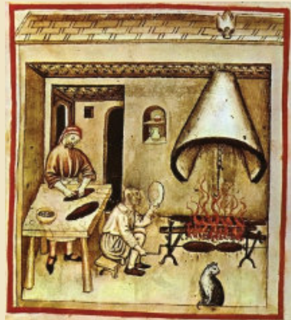
Tacuinum Sanitatis published in 14th century Lombardy, Italy.

If you want to make rice in the best possible way, for twelve persons, take two libre of rice and two libre of almonds, and half a libra of sugar. Then take the rice, well cleaned and well washed, and take the almonds, well skinned and well washed and well ground and well sieved. Take the rice and put it on the fire in clean water, and when it has reached a full boil and has been well skimmed, drain it immediately and add a quantity of almond milk; and cook it at a distance from the fire, and stir around often in such a way as not to break [the grains]. And when it has become dry, again add a quantity of almond milk; and when it is nearly cooked, add a quantity of sugar. His dish should be with and very thick. And when it is cooked, put sugar over the bowls. If you want to make it for more persons, or for fewer, use the ingredients in these proportions.